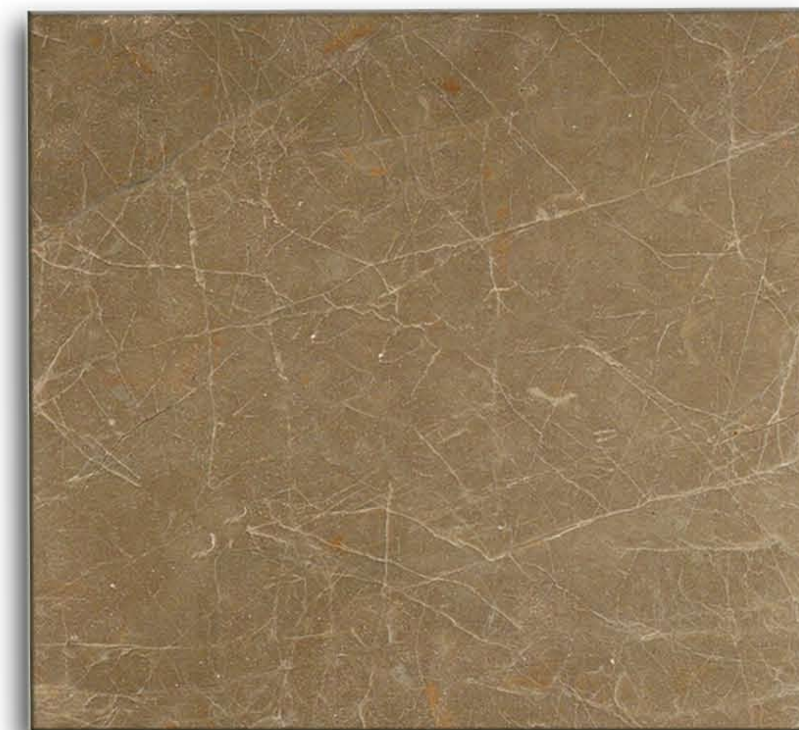
APOMAZADO / HONED