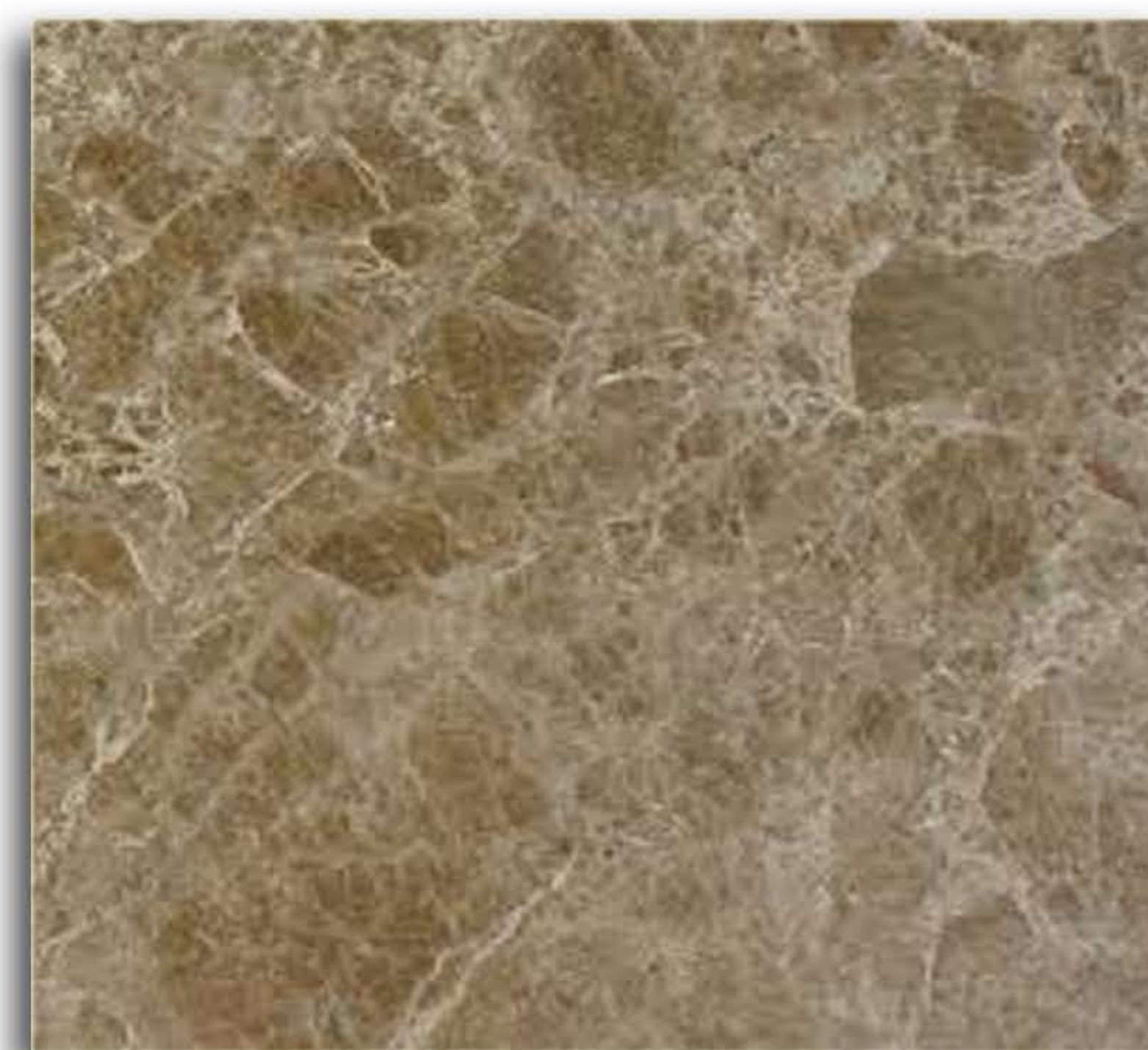
ENVEJECIDO / AGED