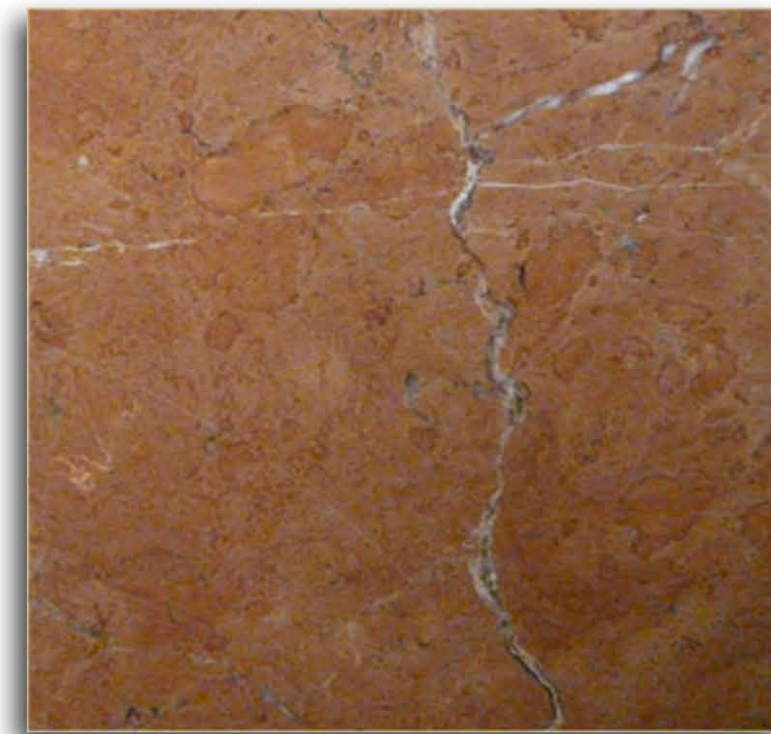
APOMAZADO / HONED