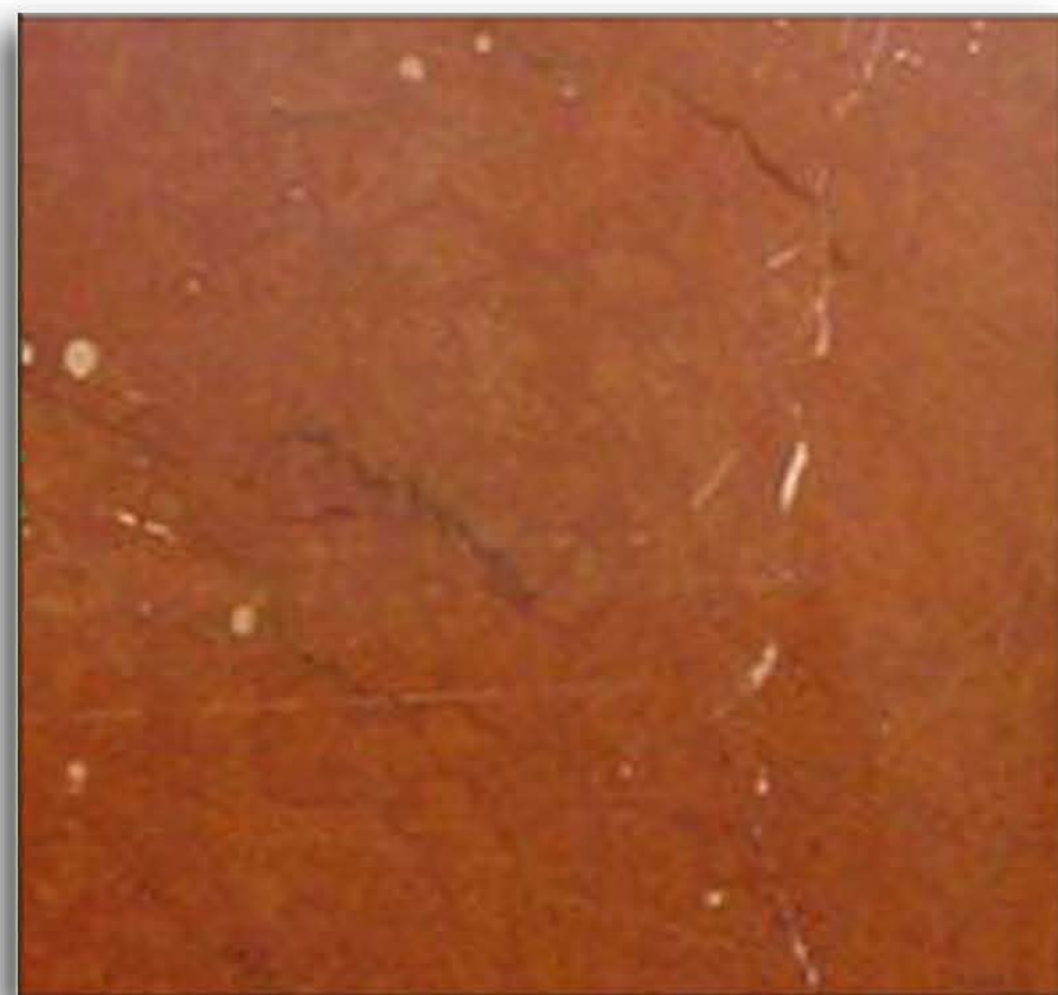
PULIDO / POLISHED